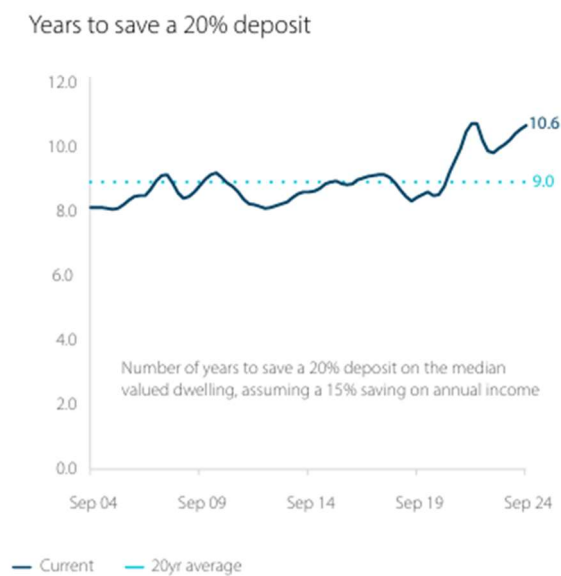
Figure 1.2: Years required to save a 20 per cent deposit