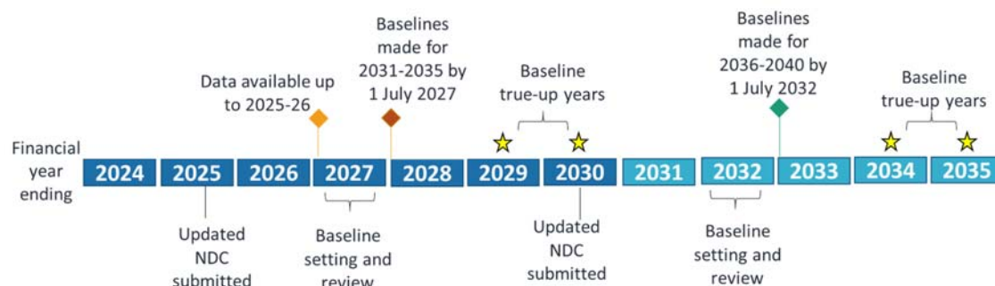
Figure 3 Indicative baseline setting timeline