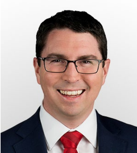
The Hon Patrick Gorman MP

I am proud to be the Minister responsible for ensuring that advice to the Government is accompanied by the best available analysis.